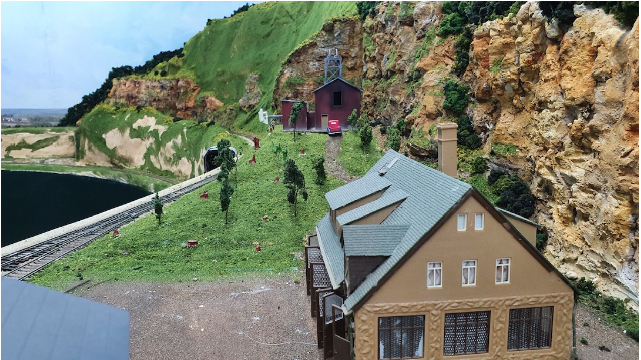
More greenery and a track leading to the mine.