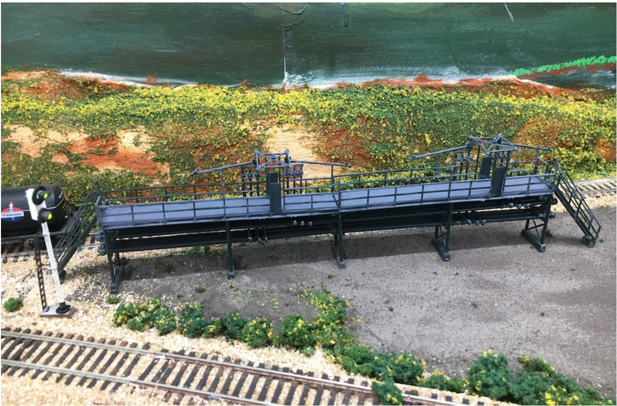
Above: Christiaan Werk has built and installed the tank car loading platform at Wallage Wells.