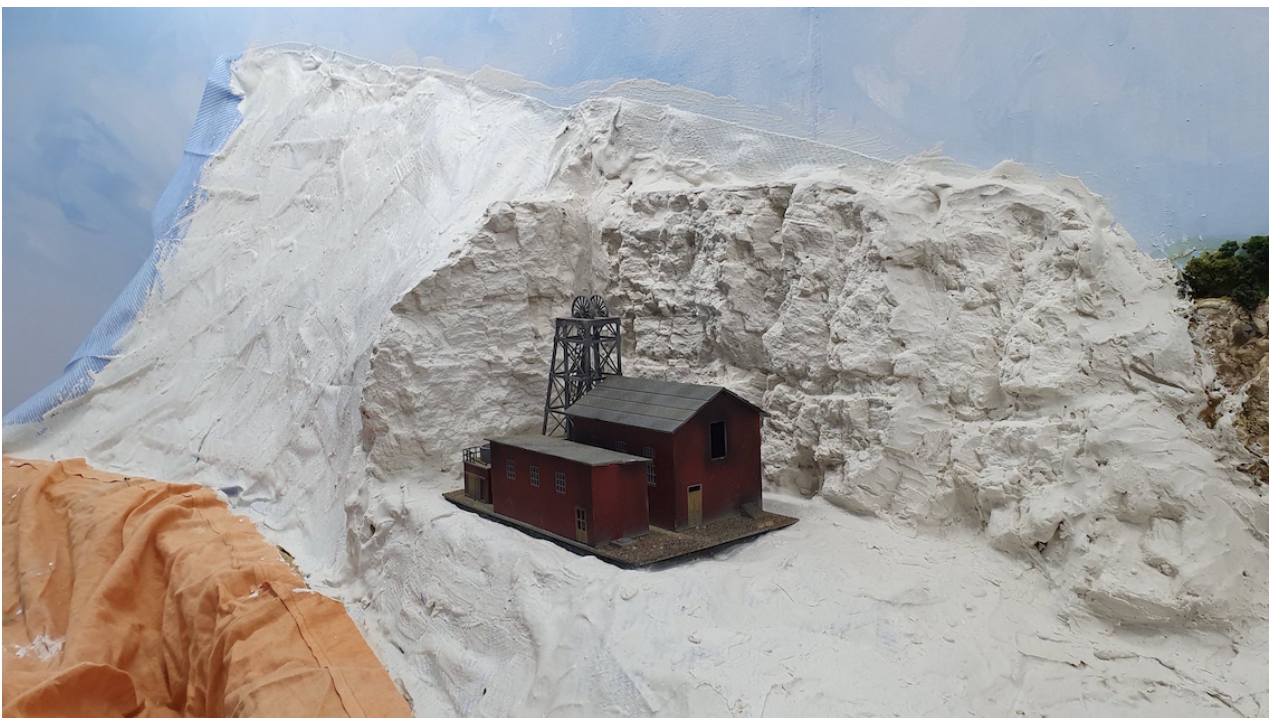
First coat of plaster