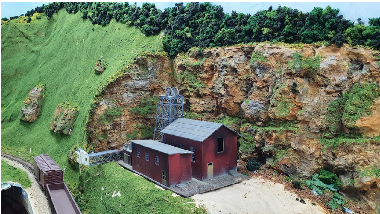
Tree line and more ground cover