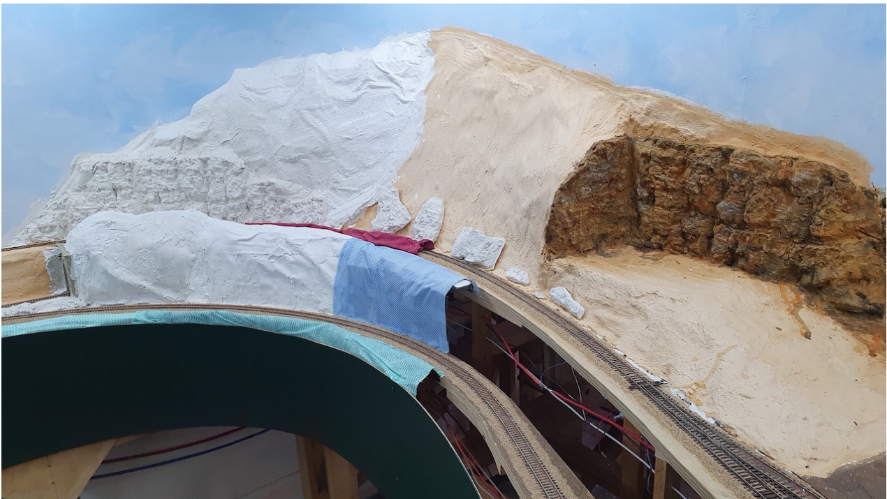
Rock moulds tinted and more rock moulds added