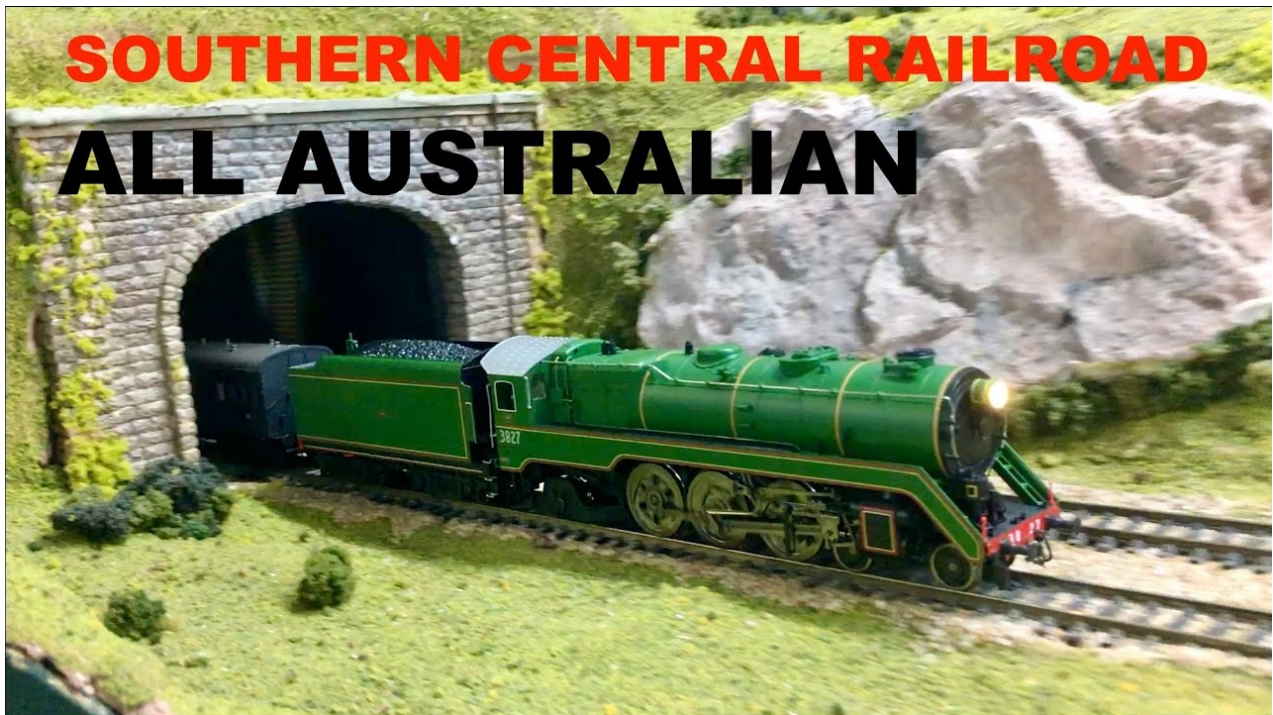
above: July running night. Billy Page's NSWGR 38 class pacific emerging from tunnel number 2.

VIDEO PAGE Please click on the images to view.